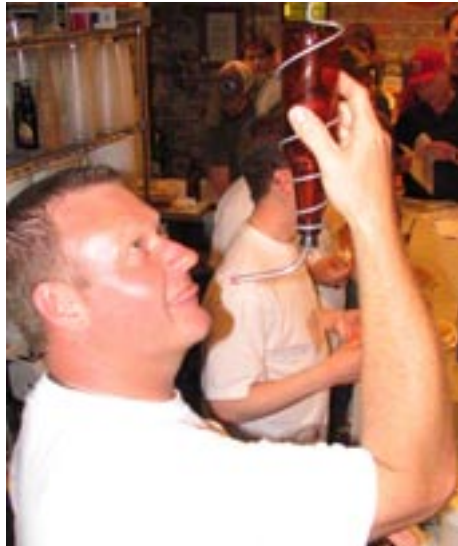
This new kind of beer bottle sucks...