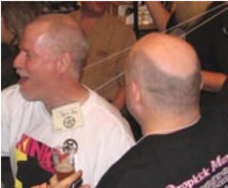
Sean Wars: The Nametag Strikes Back!