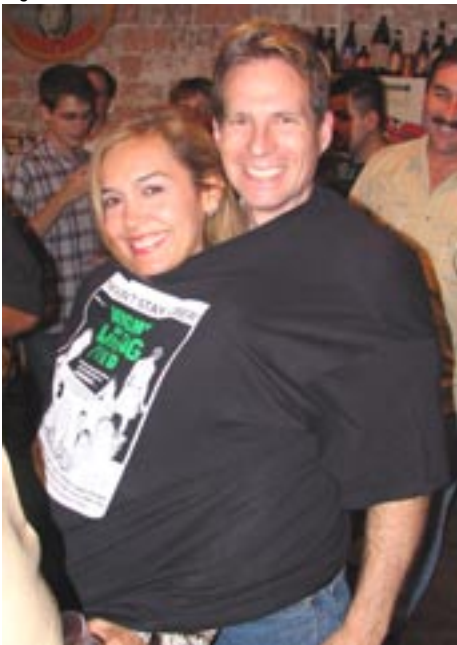
Sandy doesn't want to get into your pants... She wants to get into your SHIRT!