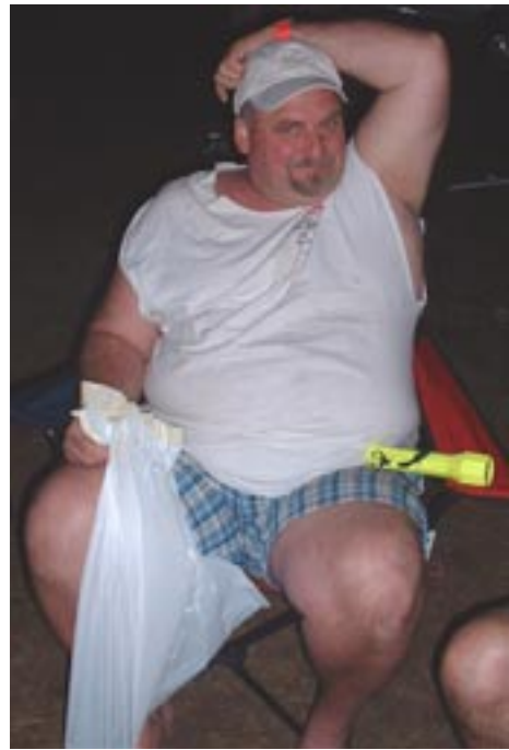
Some things are best left in the dark...