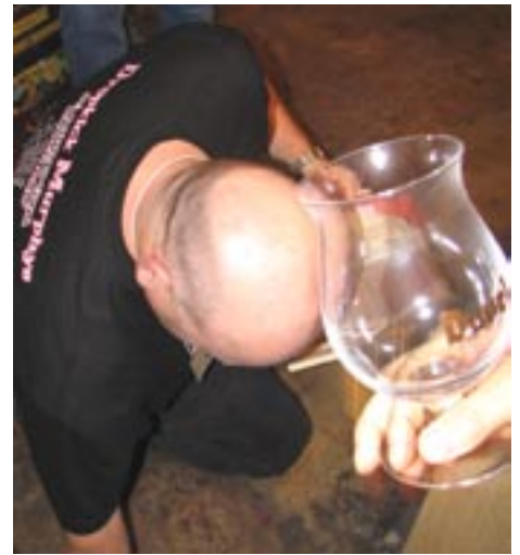
Old School Foamies... Word...