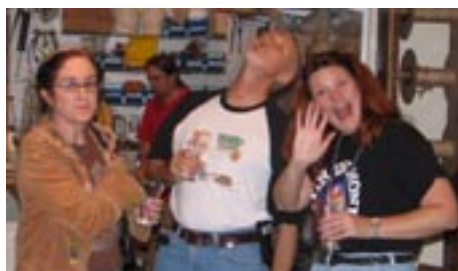
Bring out a camera, watch the reactions...