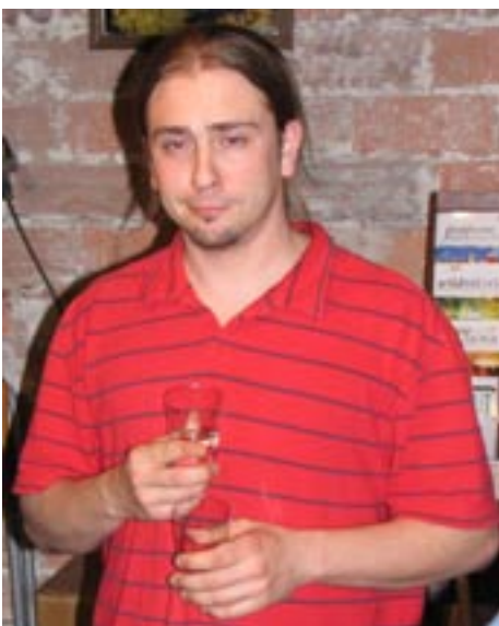
"I just love beer... and I think, in all honesty, it loves ME!"