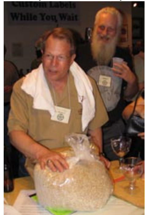
You're telling me you can actually make BEER with this crap?