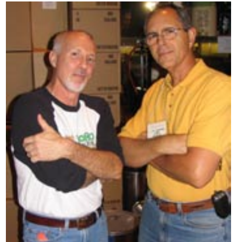
Over 30 Foam Rangers got “Kinky” at the March meeting!