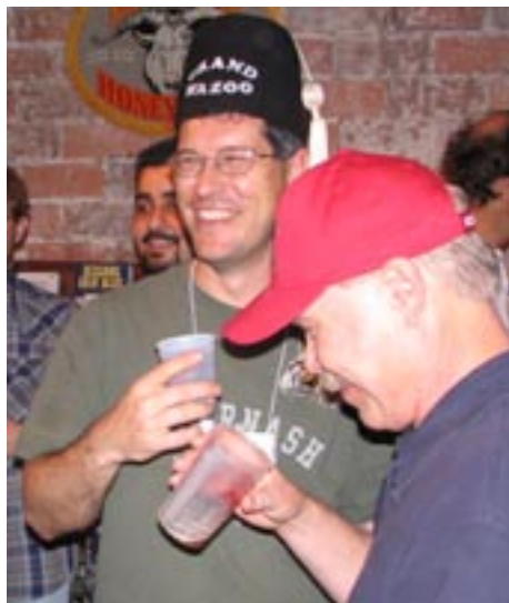
Donald falls for the Wazoo's old “tassel in the beer” trick