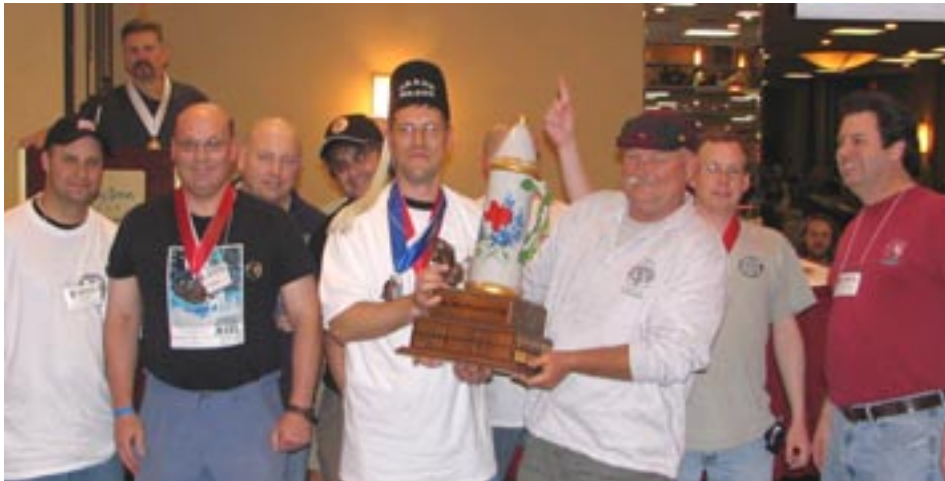
Victorious Foam Rangers accept the Bluebonnet Cup