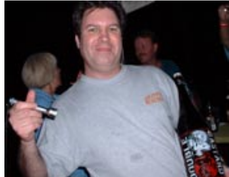
Double Bastard (the beer) in the flashlight