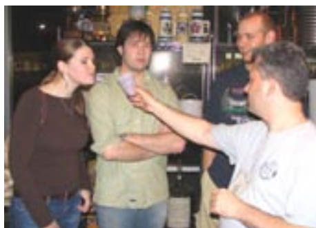
Here, kitty, kitty, kitty...