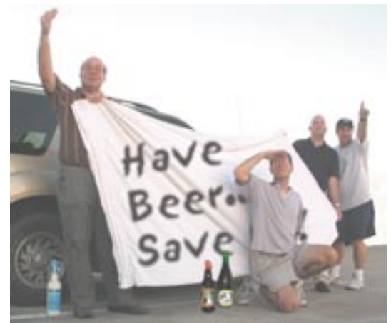
The "Foam Rescuers" keep a sharp eye out for a helicopter to airlift them and their precious cargo to safety.

The story began to unfold Sunday August 28 th when news about the Category 5 storm bearing down on the beloved Crescent City reached Houston. Immediately, five Foam (Continued on Page 11)