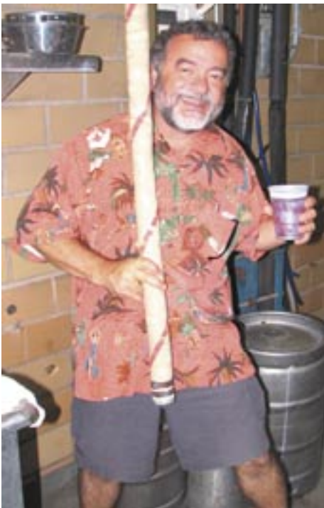
Beerbo reminds us all that a brewer can never have too much hose.