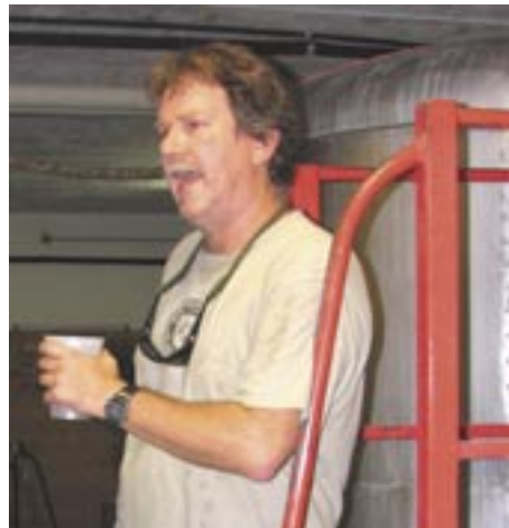
Chip wonders what he did to deserve us dropping in to visit.