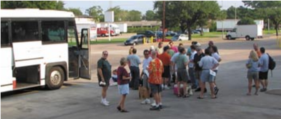
9:00 a.m. Pub Crawl departure & barleywine festival