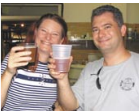
Scott "Wifenswapper" discovers that two (or is it four?) can play THAT game!