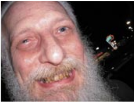
Night of the Grinning Bennie