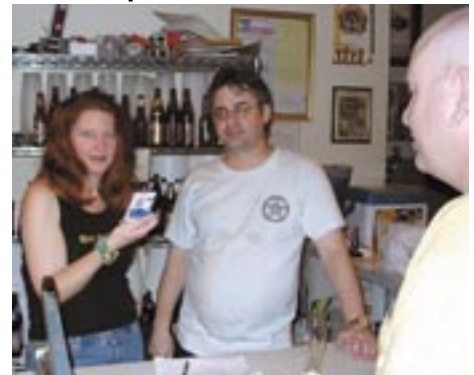
You think this ID is going to get you beer? Think again Mister!