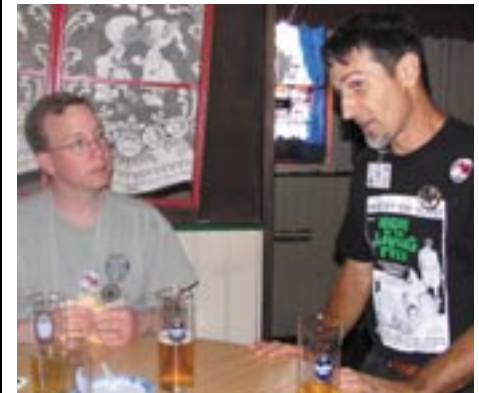
Zombie Brewer plots how to get the yeast he wants.