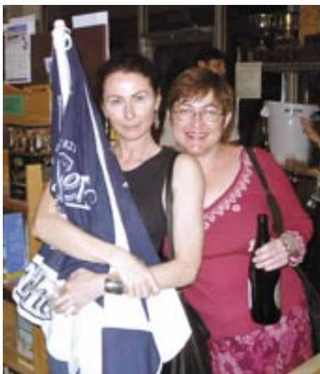
Happiness is a big umbrella... I guess.