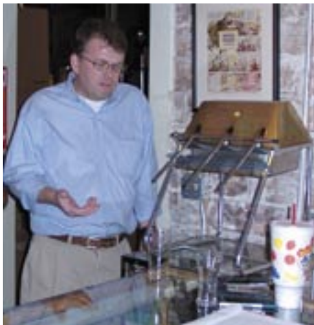
I don't know either...