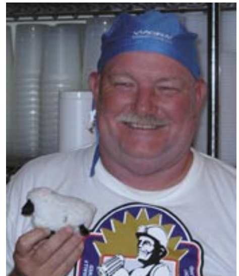
Viagra cap, Celebrator "earring," Tiny sheep, Evil grin... Not going to touch that...