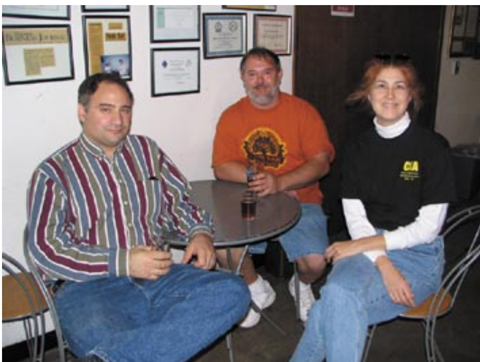
Elusive Cane Island Alers (aka: C.I.A.) enjoy the holiday spirit with their fellow homebrewers.