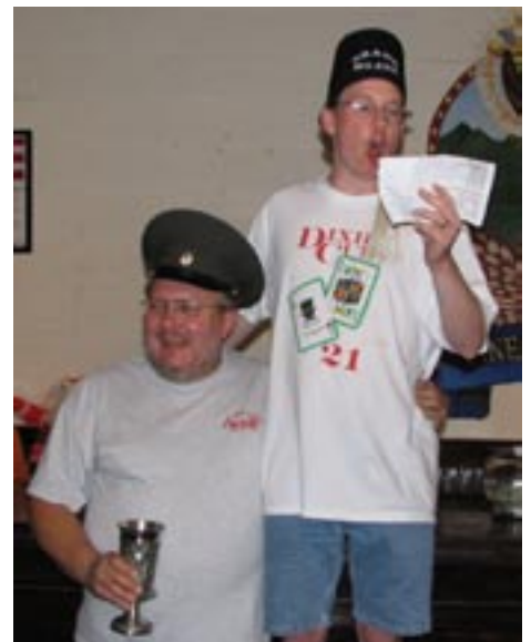
You may not know the songs, but be glad you can't hear them.