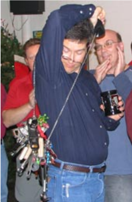
What's that smell? Oh, sorry, it's me...