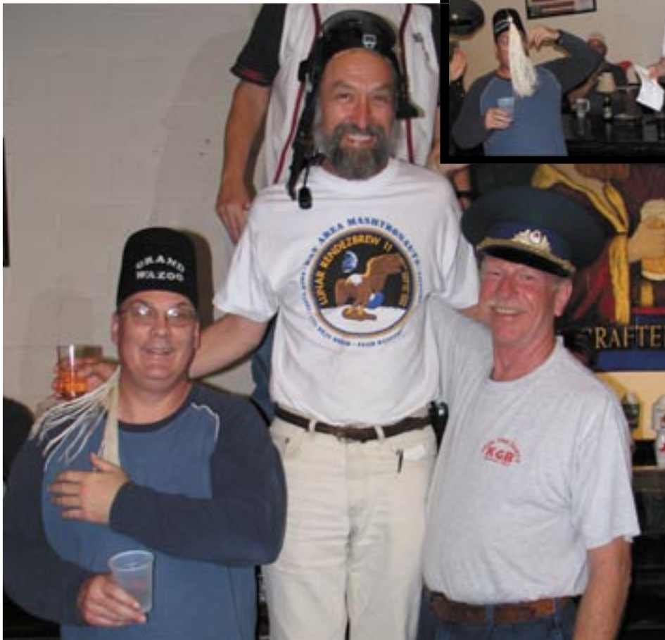
The Houston homebrew clubs are in deep trouble...