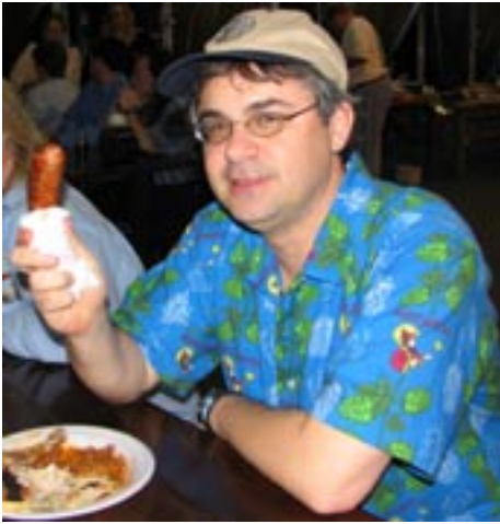
<Insert weiner joke here>