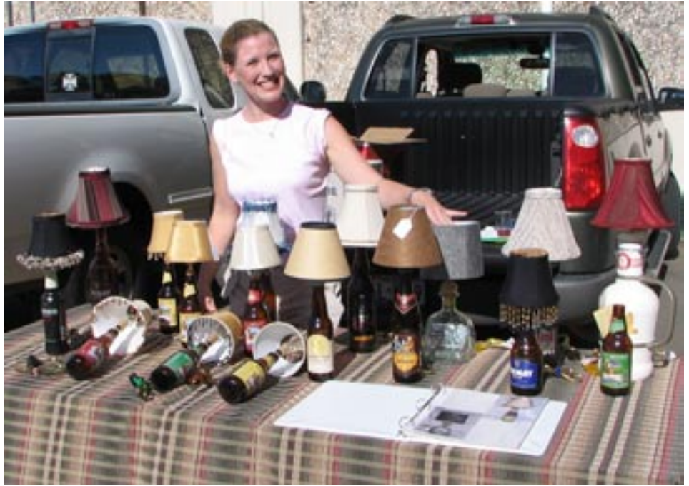
These lampshades are WAY too small for our heads...