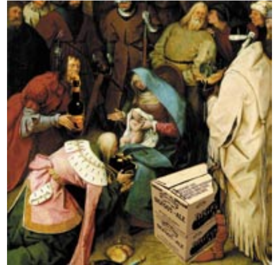
Wise men always bring beer!

"We had an open house on Christmas day and several friends and neighbors came by for free drink and food. Anyway... my neighbors have been pretty good about drinking my beer this year and saying nice things. Well...that is until they tried my Judge [Lance] Ito Imperial Pilsner. Hell, I don't know went wrong with it. It was my first (and probably last) pilsner. It was about 1085 original gravity and I left it out to get the fermentation started at room (Continued on Page 8)