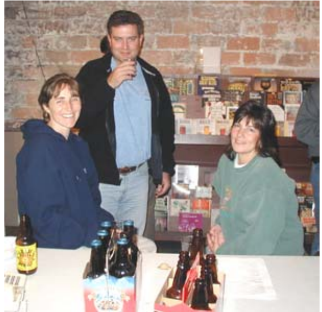
Meeting newbies quickly learn where the "Poll Position" is for the Beer of the Month