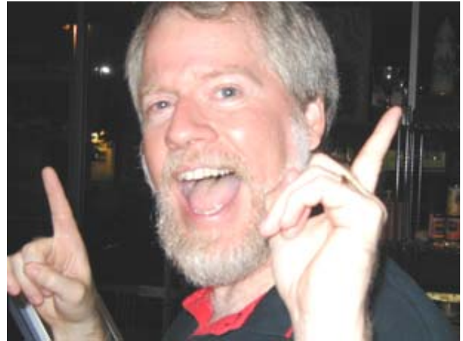
Any of you foxy ladies want to hit the dance floor with "Disco Skirt Boy" ?