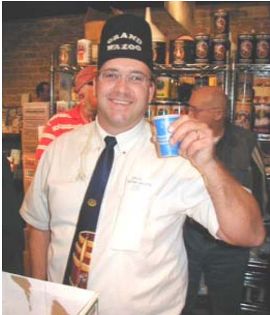
I'll be so glad when I don't have to wear this sweaty thing!