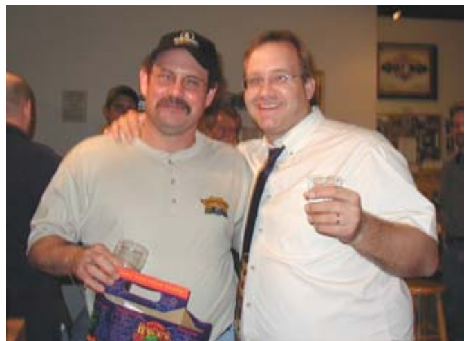
But now the days are short - I'm in the autumn of my term - and now I think of my term as vintage brew from fine old kegs - From the brim to the dregs - It poured hoppy and clear - It was a very good year....