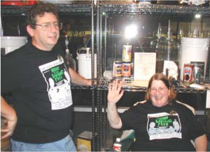
The Wiggers just seconds before a bright light fills the room and they inexplicably vanish (or not)