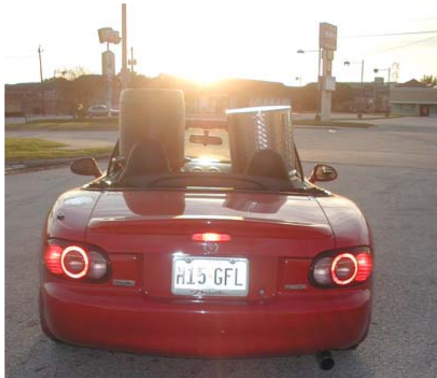
The 2002 Brewsletter Urquell editors ride off into the sunset