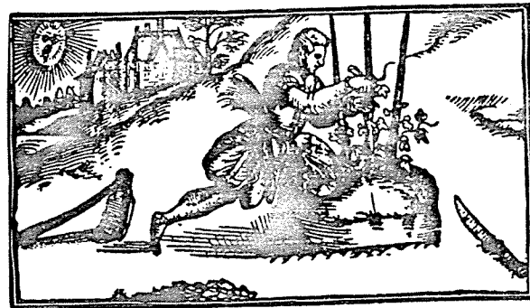
TYING OF HOPPEs TO THE POALES.

"When your hoppes are growne about one or two foot high, bynde up (with a ruthe or a grasse) such as decline from the poales, wynding them as often about the same poales a you can, and directing them always according to the cours of the sunne."